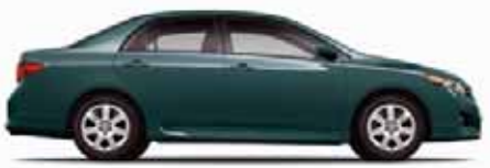
CAPRI SEA METALLIC 1 Bisque or Ash (Corolla, LE and XLE) interior