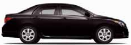
BLACK SAND PEARL Dark Charcoal (S and XRS), Bisque or Ash (Corolla, LE and XLE) interior