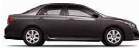
MAGNETIC GRAY METALLIC Dark Charcoal (S and XRS), Bisque or Ash (Corolla, LE and XLE) interior