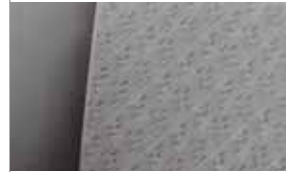
Corolla fabric in Ash