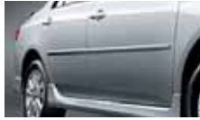
Body side moldings

Add a personal touch to your Corolla with Toyota accessories. Some accessories may not be available in all regions of the country. See your Toyota dealer for details.