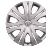
XLE standard 16-in. steel wheel with full wheel cover