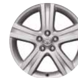
XRS standard 17-in. alloy wheel