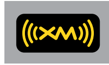
XM Satellite Radio 6