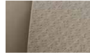
Corolla fabric in Bisque