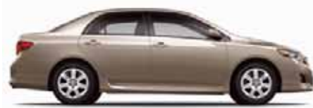
DESERT SAND MICA 1 Bisque (Corolla, LE and XLE) interior