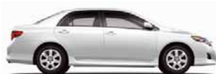
SUPER WHITE Dark Charcoal (S and XRS), Bisque or Ash (Corolla, LE and XLE) interior