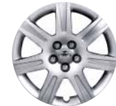
S standard 16-in. steel wheel with full wheel cover