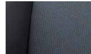
S fabric in Dark Charcoal