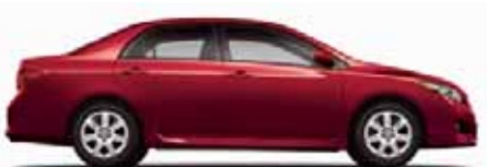
BARCELONA RED METALLIC Dark Charcoal (S and XRS), Bisque or Ash (Corolla, LE and XLE) interior