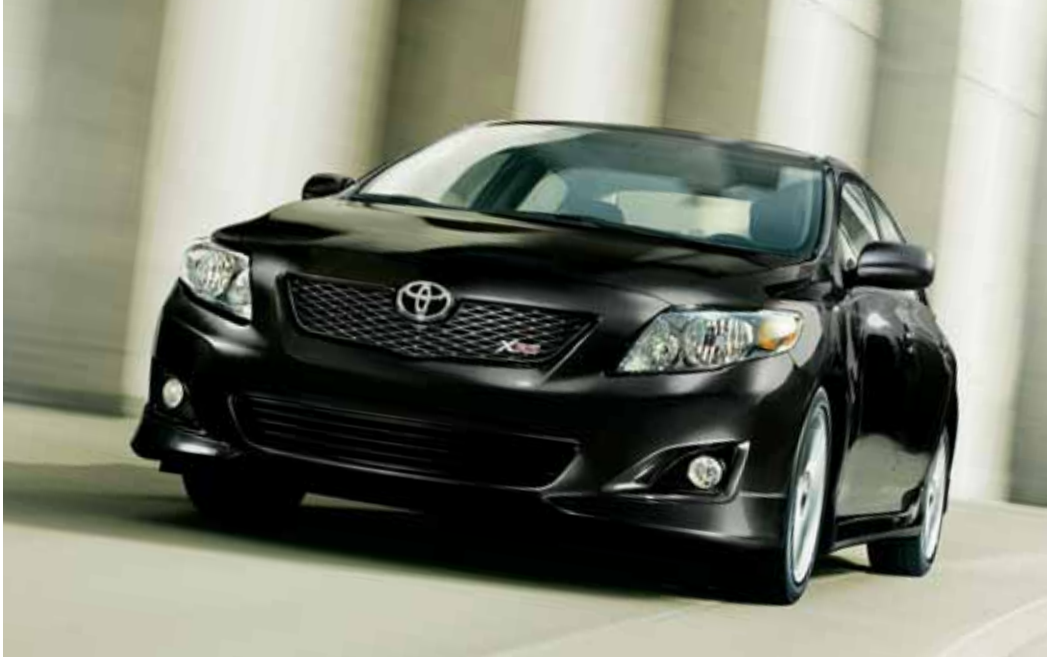
XRS shown in Black Sand Pearl with available moonroof.