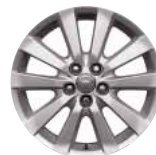
LE, XLE and S available 16-in. alloy wheel