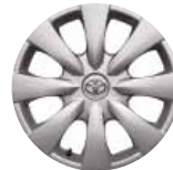
Corolla and LE standard 15-in. steel wheel with full wheel cover