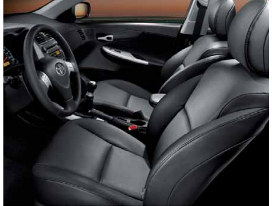
XRS interior shown in Dark Charcoal with available Power Package and Leather Trim Package. 1, 2

Corolla is the world's all-time, best-selling sedan. 3 Why the worldwide popularity? It starts with engineering that builds reliability and longevity into every component. Then add a long list of standard safety features that give Corolla owners peace of mind. Finally, there's the design: a bold statement of style that elevates Corolla to a new level of sophistication. The 2010 Toyota Corolla. Moving Forward.