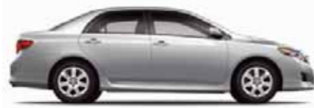
CLASSIC SILVER METALLIC Dark Charcoal (S and XRS) or Ash (Corolla, LE and XLE) interior