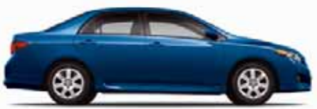
BLUE STREAK METALLIC Dark Charcoal (S and XRS) or Ash (Corolla, LE and XLE) interior