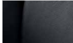
S and XRS leather in Dark Charcoal